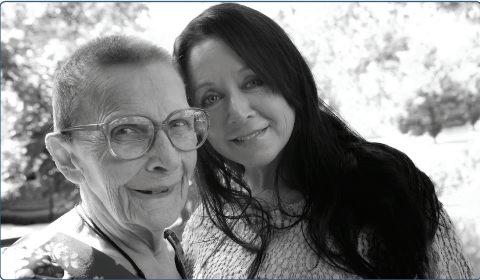
Thank you for supporting MOWCTX and the homebound Central Texans we are honored to serve!